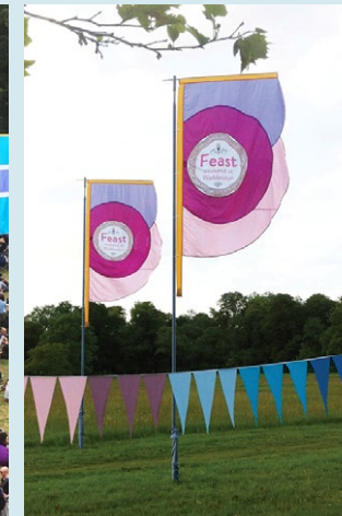
Feast at Waddesdon Manor