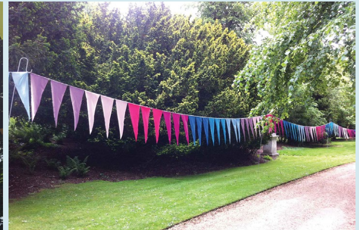
Ombre Spring Large