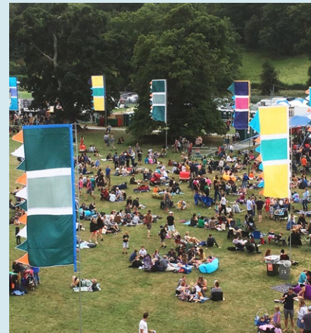
Greenman Festival 2018