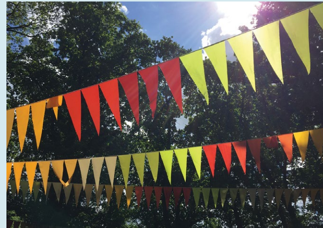
Ombre Autumn large