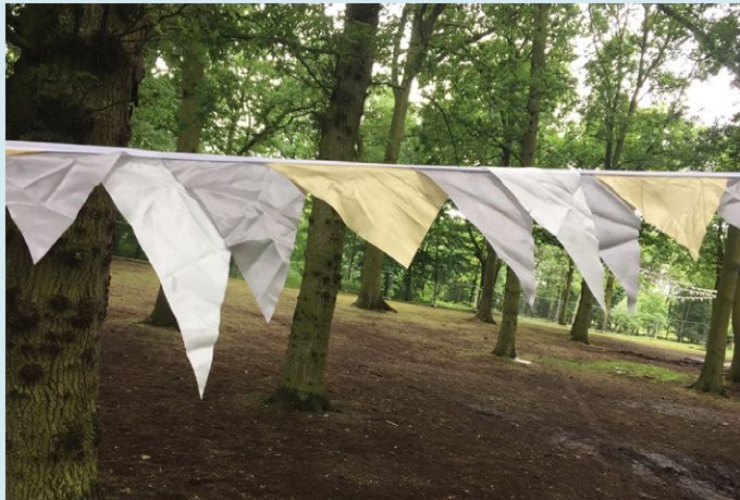
White & Gold